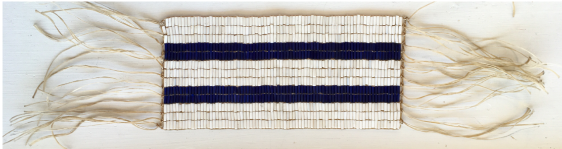
Figure 1. Two-Row Wampum Belt

article explicitly privileges Indigenous ways of knowing through telling stories in a two-row visual code. It is intended to brighten our minds.